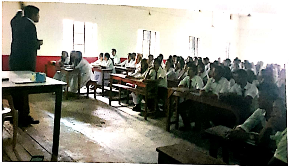
Digital Literacy Programme in Progress

An advanced computer training course in 'E-Finance & E-Commerce' for commerce students and 'Certificate course in Graphic Designing Technology' for Arts students was imparted from Aug-Oct 2016.