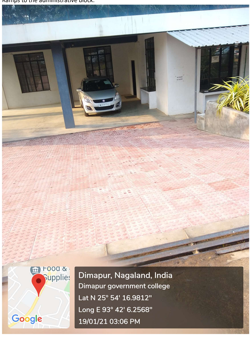
Ramps to the administrative block.