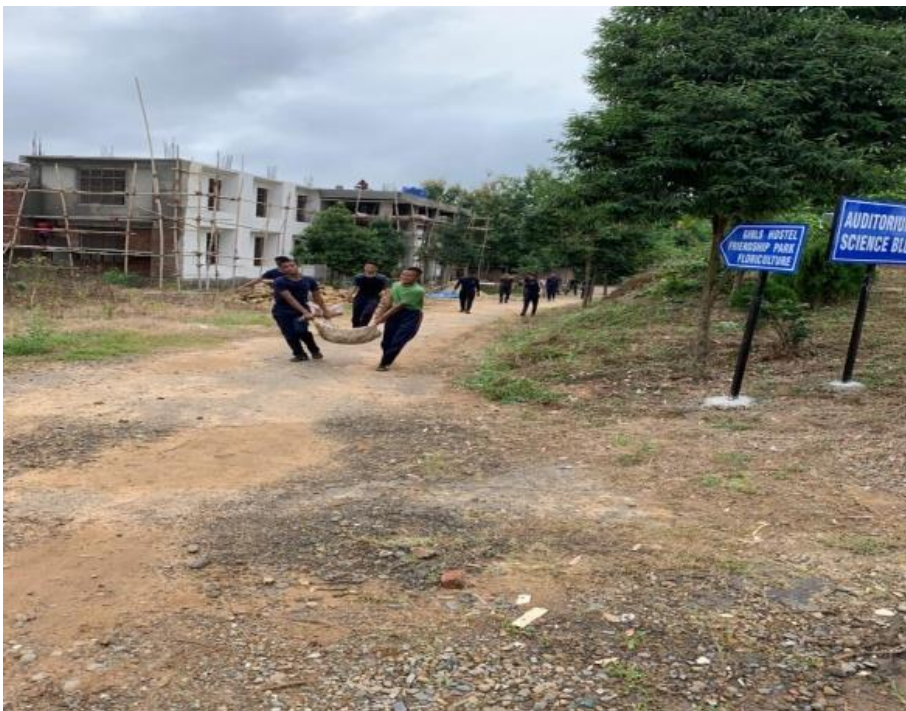
➤ Mass Social work by faculty, staff, DGCSC and NSS/NCC on 18/09/2021 and 25/09/2021.