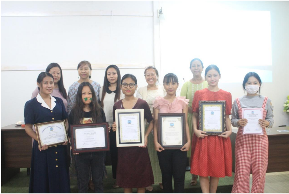
Photos of Award Winners with Awards Committee members