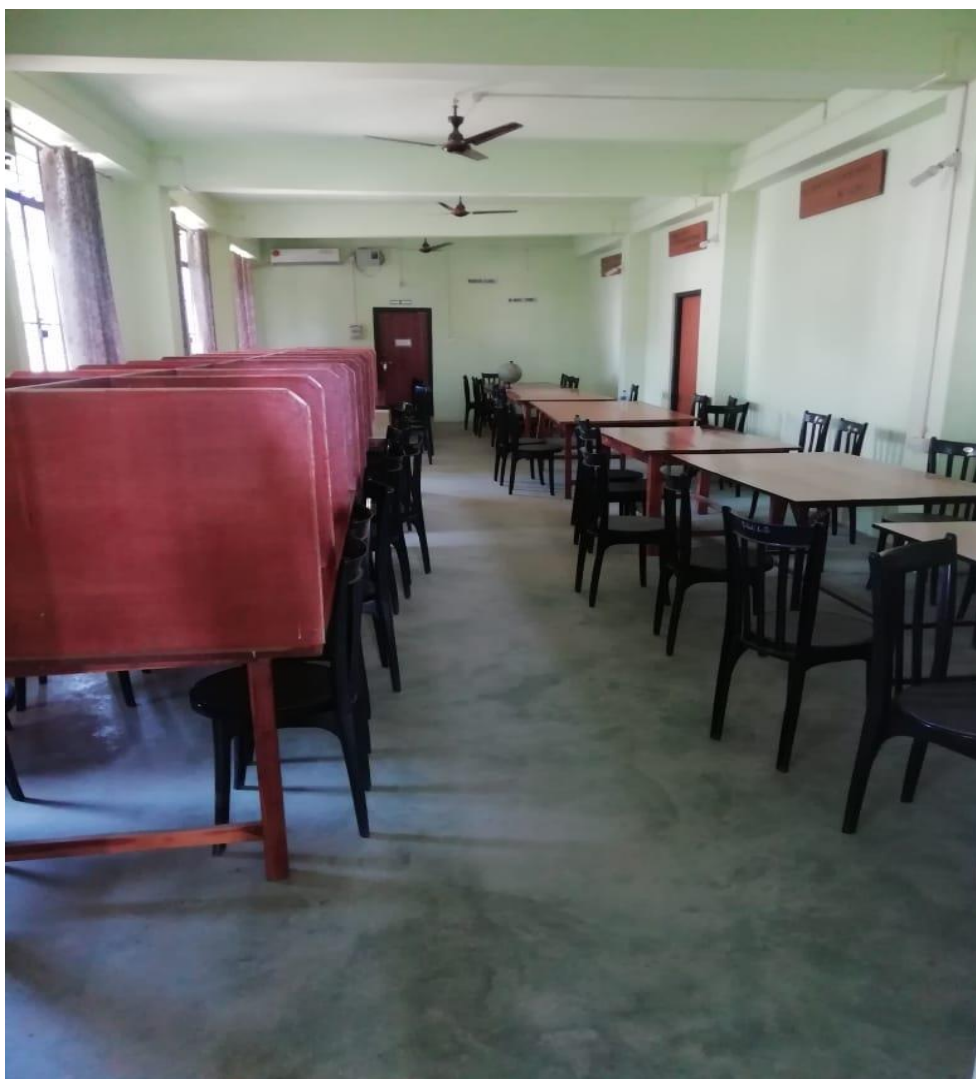
Upgradation of the Library reading room: