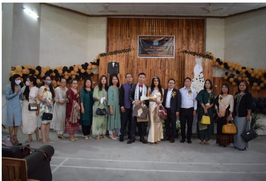
Mr. and Miss Fresher 2021-22 with the Teaching Staff