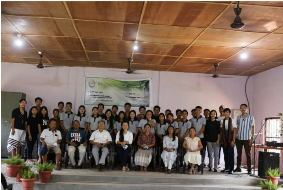
NSS DGC attended the 1st Foundation Day of Phevima Eco Club, its adopted village. Eleven (11) volunteers of NSS and carried out the plantation drive along the roadside to create awareness about preserving the environment on 10/09/2021.