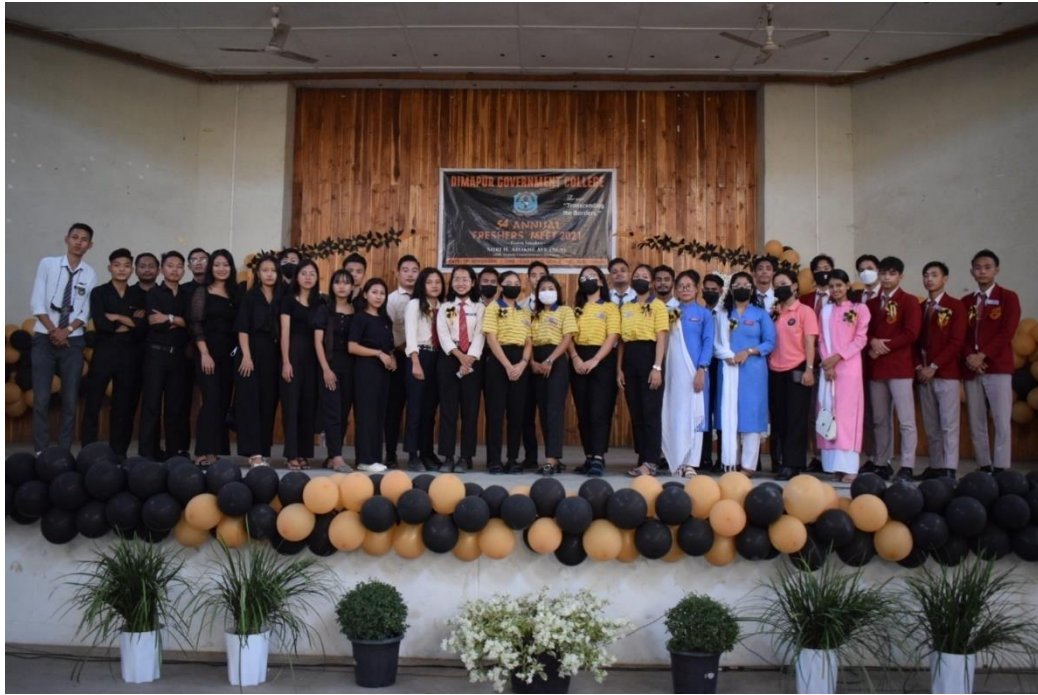
Students singing College Anthem