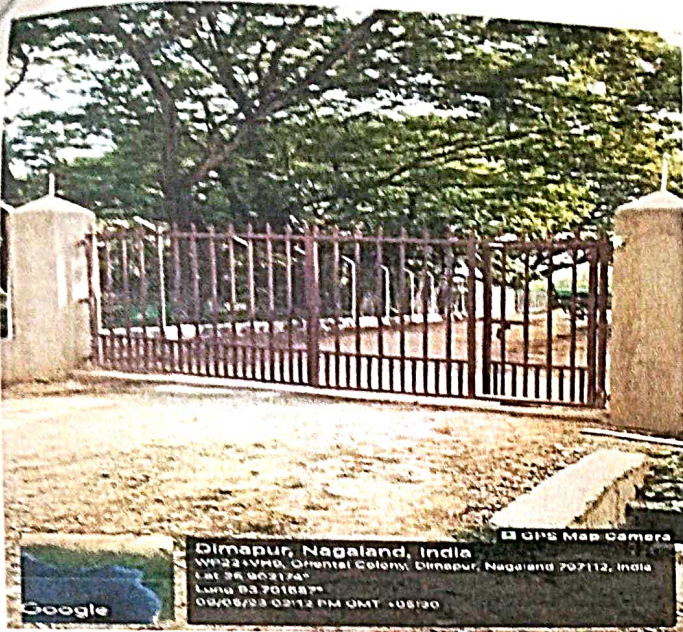
Boys Hostel Gate and Fencing