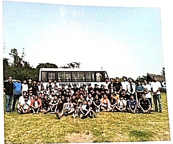
Hostel Picnic on 22 nd April, 2023