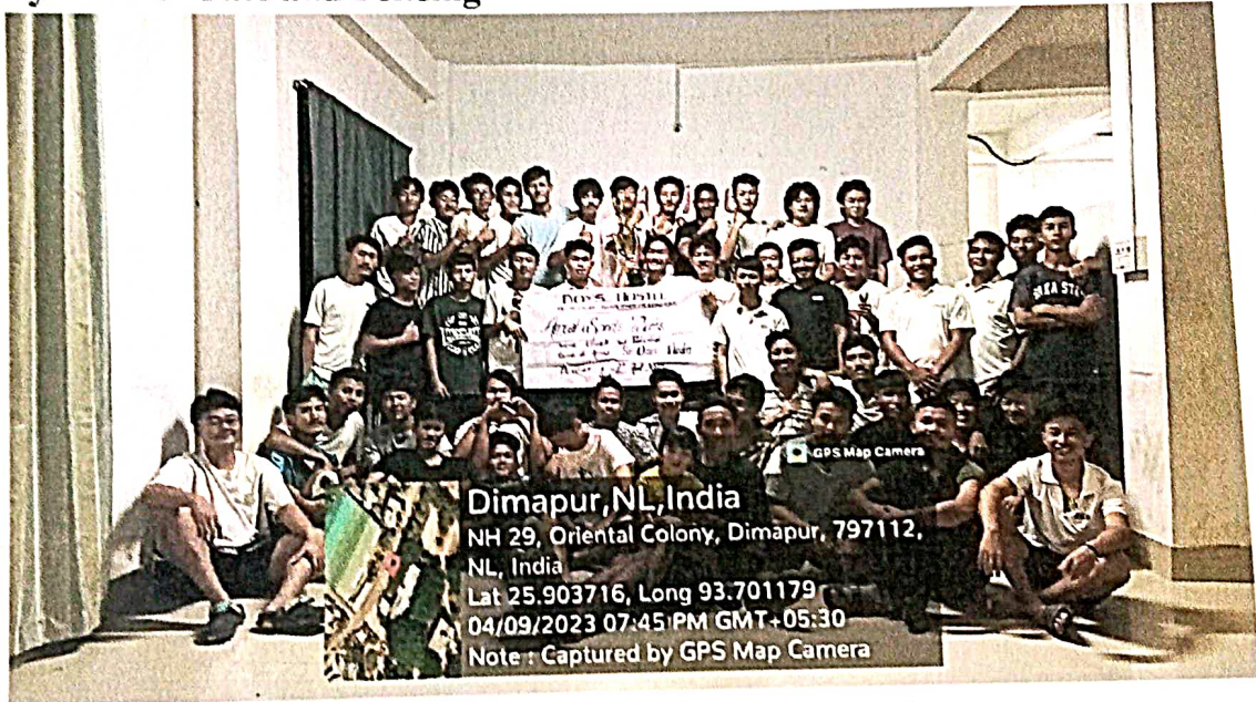
Annual Sports Week 7 th - 9 th April, 2023