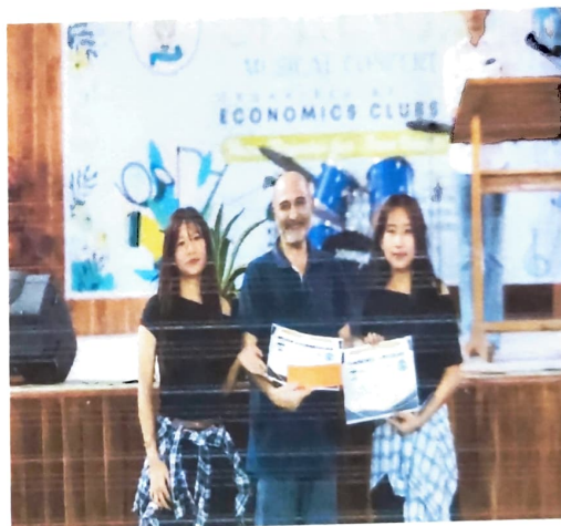
Winners for the Group Song Competition: